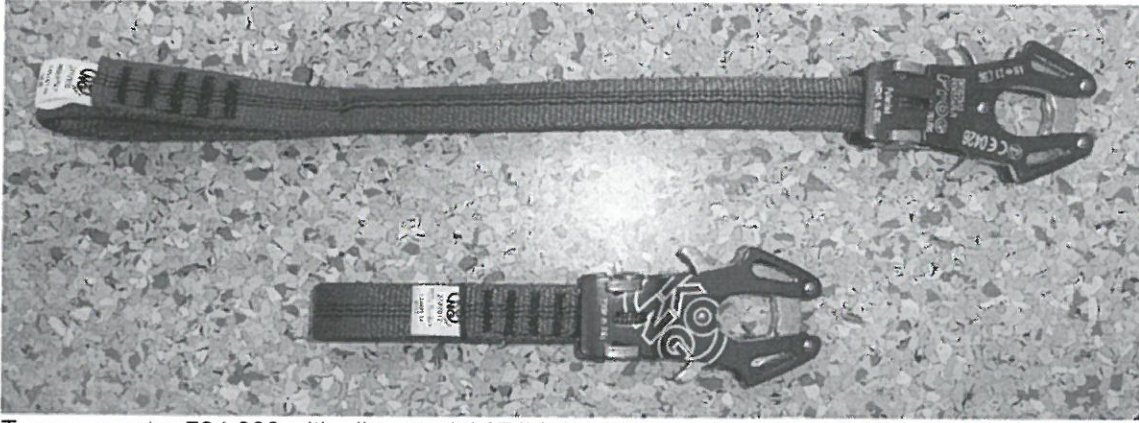
Top: connector 704.000 with sling model 271V00; bottom: connector 704.000 with sling model 27V00

Department: GARTCP / kn Date: 2015-01-22